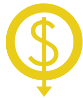
Job Costing Estimates

Integrated modules provide both management and operational tools and are especially suited to sub-contract, KOP, Kan-Ban, made-for-stock products and 'make to order' manufacturing, including assemblies. The comprehensive report generation and search capabilities enable you to continually evaluate performance and improve the efficiency of the total manufacturing process through variance analysis and improved control of lead times, inventory and work in progress.