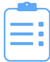
Easily Create Quotes